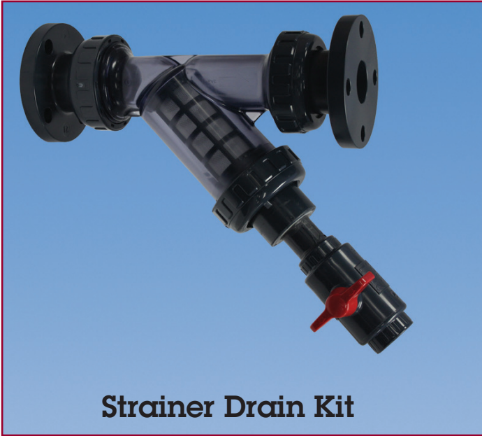
Strainer Drain Kit

Asahi/America Inc., introduces Sediment Strainer Drain Socket kits complete with Omni® Type-27 ball valves for quick and easy cleaning of sediment strainer screens without removing the screen support assembly. The ball valve can be opened to purge the screen area of waste and debris. Valve is supplied loose for piping waste pipe to desired location.